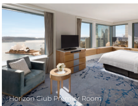
Horizon Club Premier Room