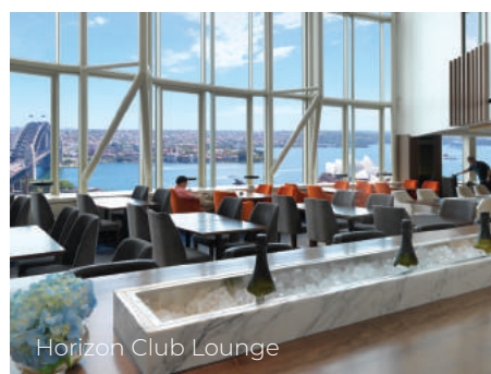
Horizon Club Lounge